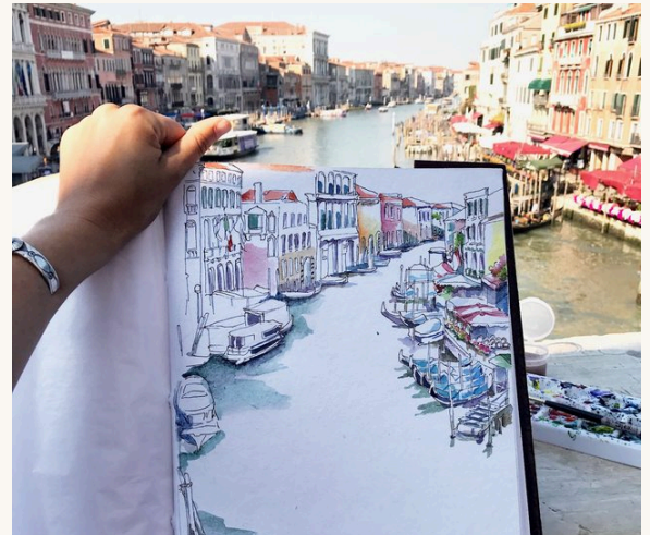
Venice, Italy · Plein air watercolor + ink