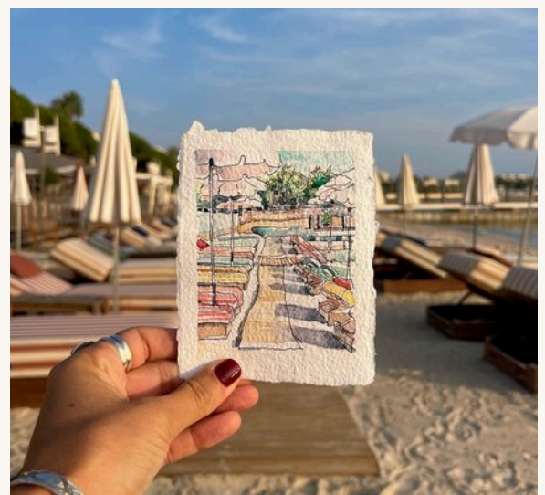
Martinez Hotel, Cannes, France