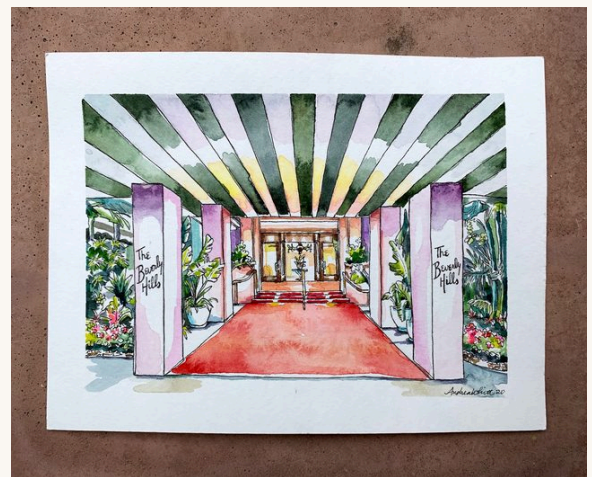
The Beverly Hills Hotel · Ink & Watercolor