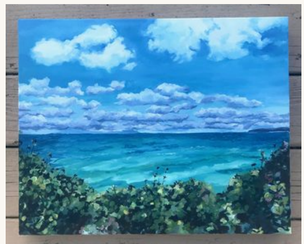
Plein air oil · Original commission